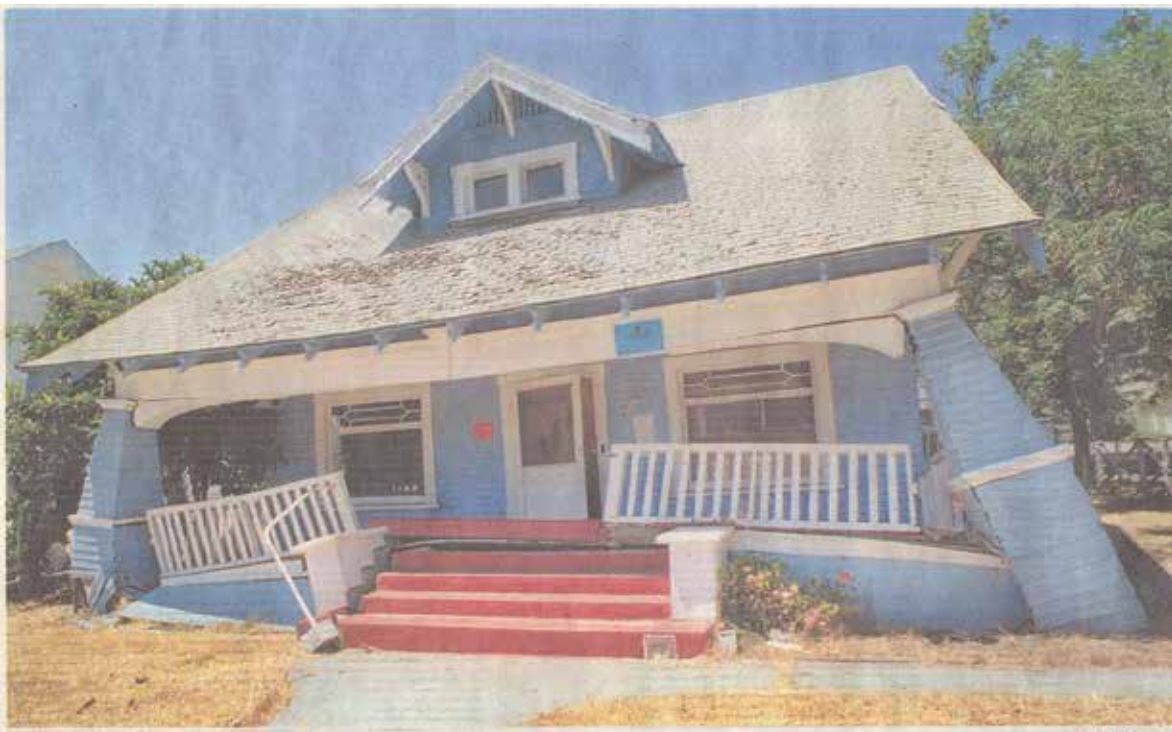
Los Angeles Times

Alan Hanson submitted these scans of Los Angeles Times newspaper headlines. The top article can be read in its entirety at http://articles.latimes.com/2003/oct/19/realstate/re-retrofit19/2