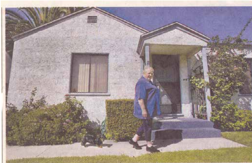
BRYAN CHAN, Los Angeles Times

A state grant program subsidizes retrofits for low- to moderate-income owners.