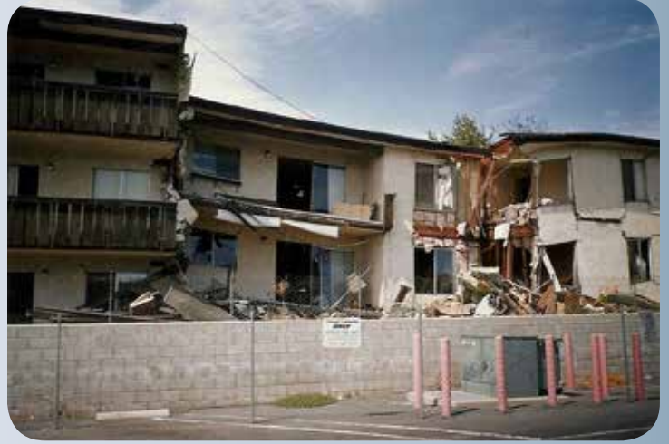
Northridge Meadows apartment building over 6 months after the Northridge earthquake, August, 1994.

While we were searching the front, eastern portion, of the complex, Riverside Urban Search and Rescue arrived and were stationed at the rear portion of the building from which they began clearing the